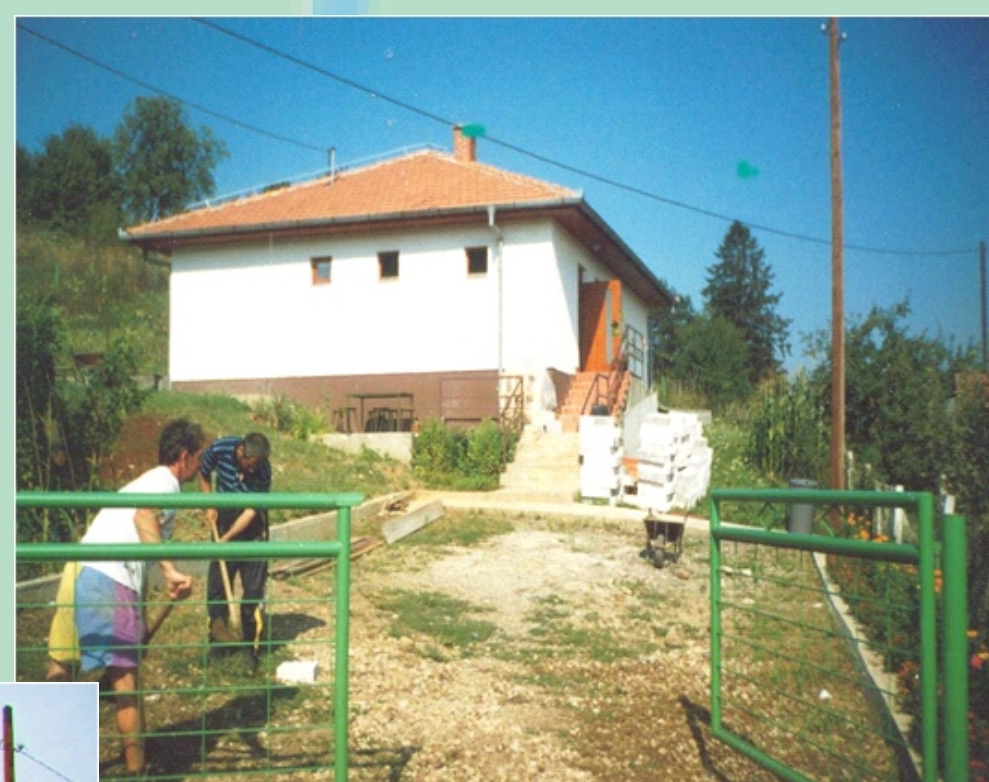
Fenix in 2007.

We soon moved downtown, but it was only in 2007 that Fenix entered current premises on the outskirts of the city. We did the decoration and expansion ourselves.